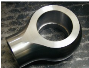
Machining of Carbon Steels for the Hydraulic Industry