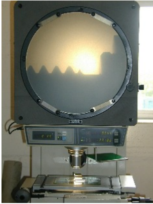
Precision checking of component size and profile