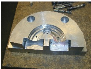
Machining of Mould Steels