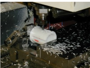
Machining of Plastics for the Laboratory and Aviation Industries