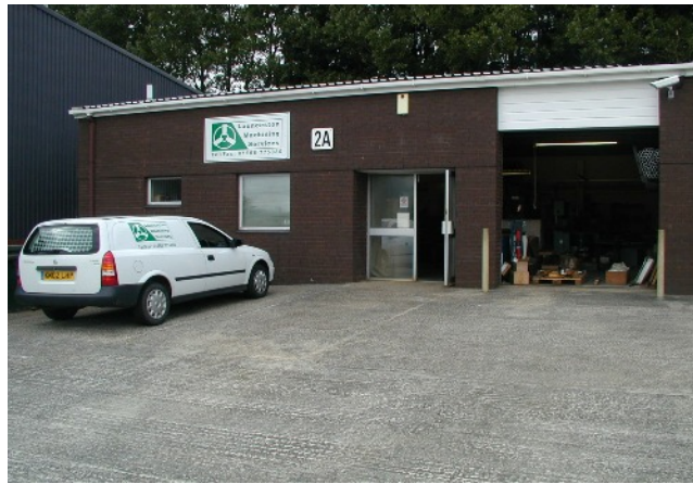
Easily accessible from the A30